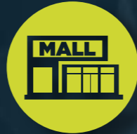
Shopping Mall area