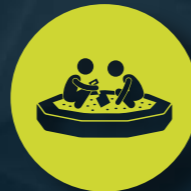
Creche and Play areas