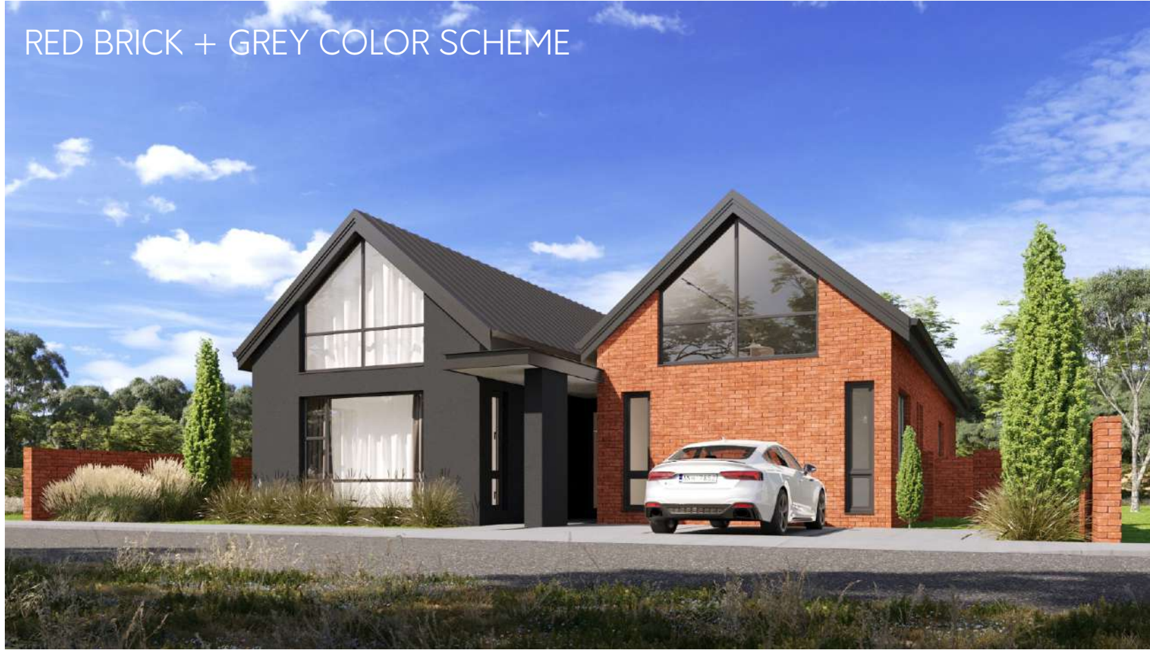
RED BRICK + GREY COLOR SCHEME