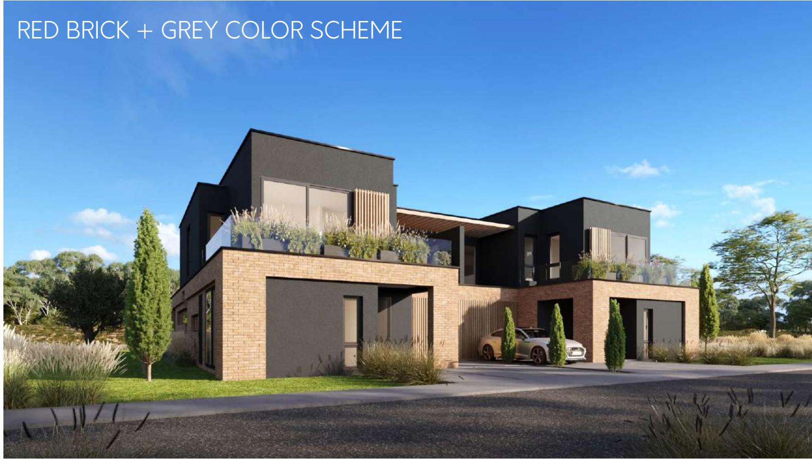
RED BRICK + GREY COLOR SCHEME